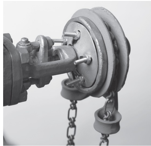
CL4 Back View